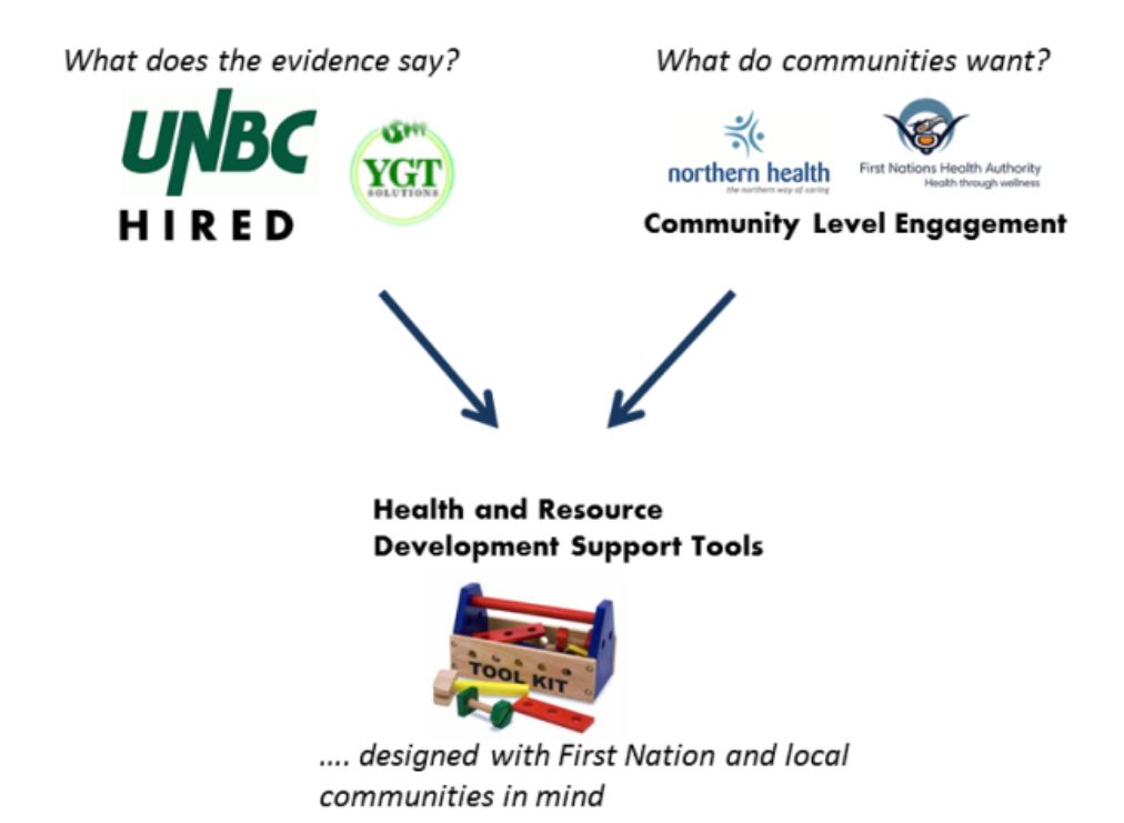
Figure 2. Supporting Northern BC communities with evidence and toolkits.

One of the key objectives of the sub-regional presentations was to seek feedback from communities on what tools, information, support, or otherwise, both FNHA and NH may be able to provide to northern communities as they respond to impacts, challenges, and opportunities in relation to individual and community health. This report provides a summary of the feedback that was received to five 'big' questions that were posed to the sub-regional caucus participants around the topic of health and resource development.