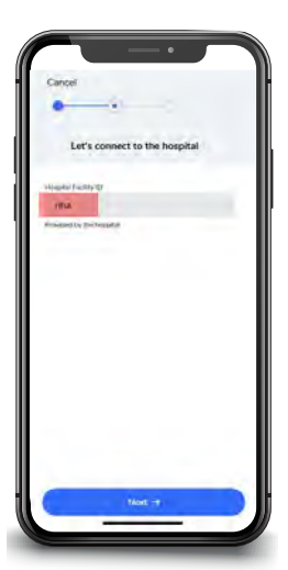
Enter facility ID: nha