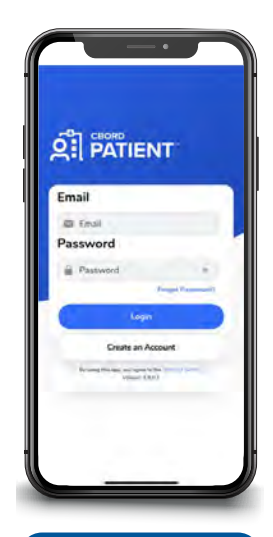
STEP 1 Tap on "Create Account"