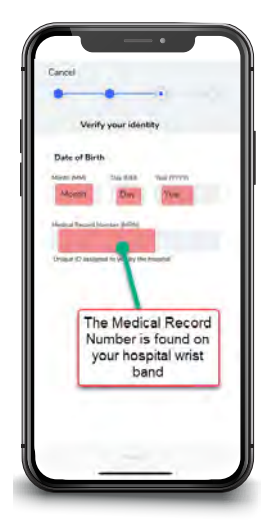
Enter your Medical Record Number and Date of Birth.