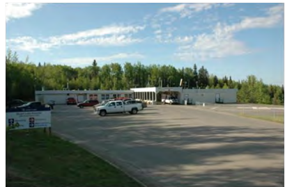
Stuart Lake Hospital, Fort St. James