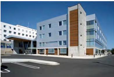
University Hospital of Northern BC, Prince George