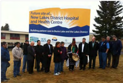
Burns Lake: Hospital Replacement