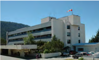
Prince Rupert Regional Hospital