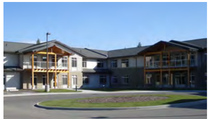
Dunrovin Park Lodge, Quesnel