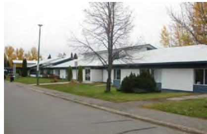
Rainbow Adult Day Centre, Prince George