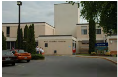
Mills Memorial Hospital, Terrace