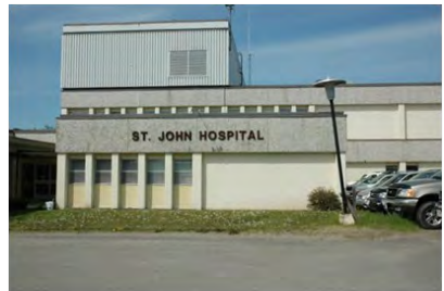
St. John Hospital, Vanderhoof