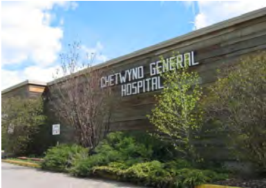
Chetwynd General Hospital