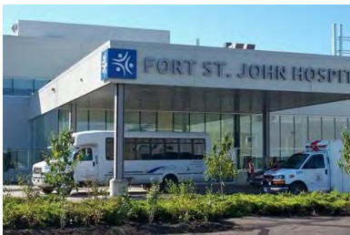
Fort St. John Hospital and Peace Villa