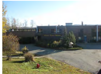
Peace River Haven, Pouce Coupe