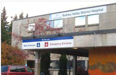
Bulkley Valley District Hospital, Smithers