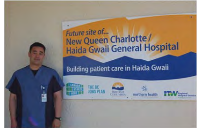
New Queen Charlotte/Haida Gwaii General Hospital