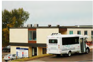
Fort Nelson Hospital