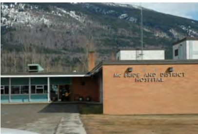
McBride and District Hospital