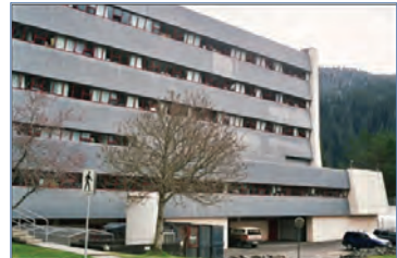
Prince Rupert Regional Hospital