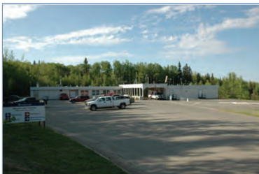
Stuart Lake Hospital, Fort St. James