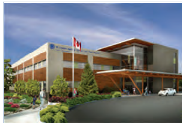
BC Cancer Agency Centre for the North, Prince George