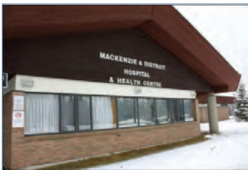
Mackenzie and District Hospital and Health Centre