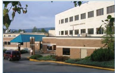
GR Baker Memorial Hospital, Quesnel