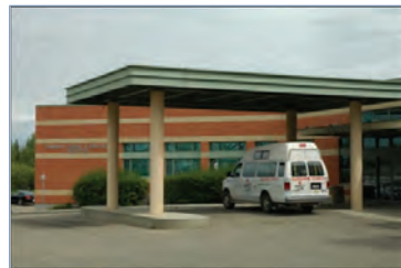
Dawson Creek & District Hospital