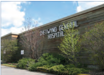
Chetwynd General Hospital