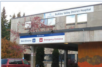
Bulkley Valley District Hospital, Smithers