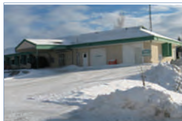
Valemount Community Health Centre