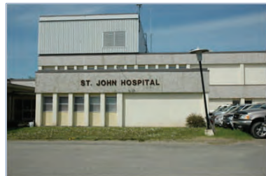
St. John Hospital, Vanderhoof