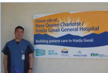
New Queen Charlotte/Haida Gwaii General Hospital