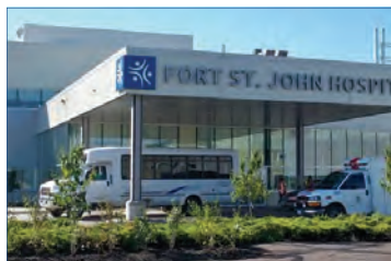
Fort St. John Hospital and Peace Villa