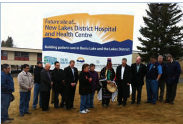
Burns Lake: Hospital Replacement