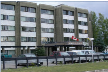
Alward Assisted Living Facility, Prince George