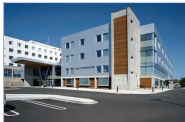
University Hospital of Northern BC, Prince George