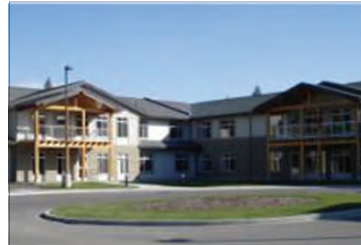
Dunrovin Park Lodge, Quesnel