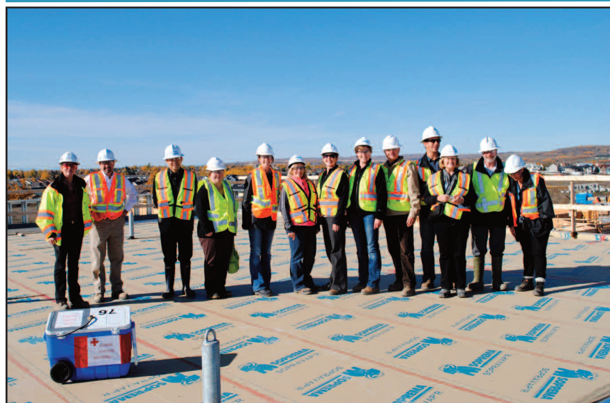
The Health Authority Infrastructure Planning Council toured the hospital construction site on September 30, 2010.