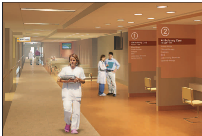
Artist's rendering of colour schemes and signage in new health care facility. See “Wayfinding”, page 2.