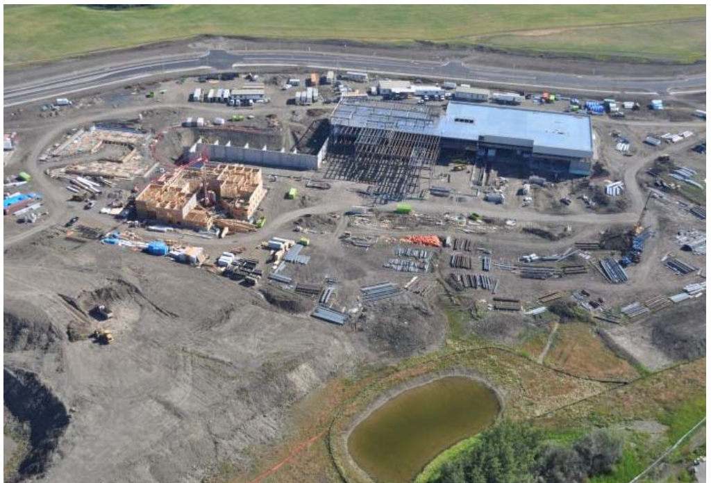
This aerial photo of the construction site was taken by David Bell, Alaska Highway News, in mid-July.

A closeup of another delightful entry from the school art contest (see front page).