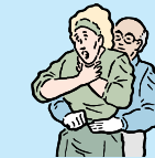
PLACE FIST MIDLINE ON ABDOMEN