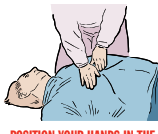
POSITION YOUR HANDS IN THE CENTRE OF THE CHEST