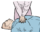
PRESS DOWN FIRMLY 30 TIMES, THEN GIVE 2 BREATHS. CONTINUE CPR UNTIL HELP ARRIVES