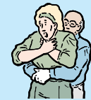
PRESS INWARD AND UPWARD

If the person becomes unconscious ease him or her to the ground and send for medical help